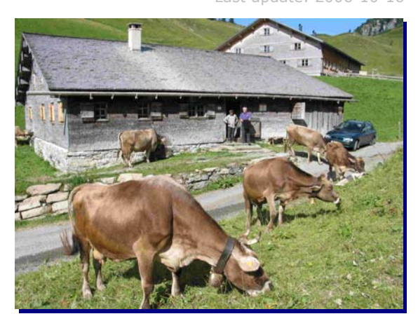
Schröcken, Vorarlberg, Austria

The 35<sup>th</sup> Course on High-Resolution Respirometry starts with a demo experiment using cultured cells, providing a practical overview of the Oxygraph-2k in action, with integrated on-line analysis by DatLab 4 , and with an application of the TIP-2k in a FCCP