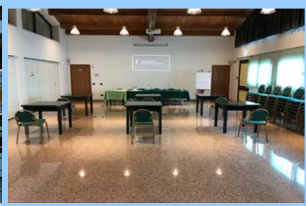
Hotel Petrarca, Euganei Hills, (Padova), Italy