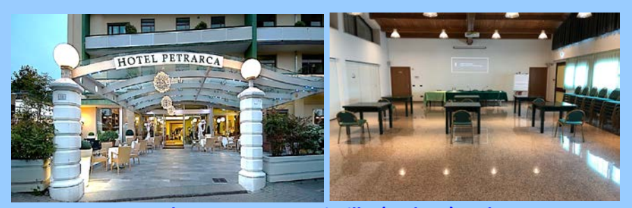
Hotel Petrarca, Euganei Hills, (Padova), Italy

2020 PaduaMuscleDays, November 19-21, Euganei Hills and Padova, Italy