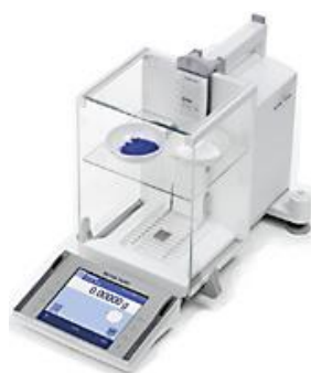
METTLER TOLEDO microbalance XS205DU

Weight measurements are made after permeabilization, eliminating variations in water contents due to osmotic stress, allowing for elimination of connective tissue during mechanical separation before weight measurement, and for partitioning of subsamples of similar wet weight.