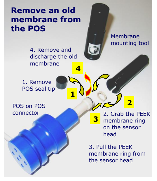
Figure 2 . Removal of a used membrane from the POS.

During cleaning of the anode and cathode, the sensor is best mounted to the blue POM base of the perspex vial in which the OroboPOS sensor is shipped. Alternatively, it can be mounted to the OroboPOS-Connector.