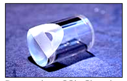
Duran glass O2k-Chamber

The O2k-Chambers are made of Duran glass and are closed by PVDF or PEEK stoppers which are as diffusion tight as titanium stoppers. The magnetic stirrer bars are coated by PVDF or PEEK. Teflon with its high oxygen solubility is avoided (<u>Gnaiger 1995</u>). Viton O-rings are used for sealing the stoppers. Butyl rubber gaskets provide the seals for the oxygen sensors. These sealing materials minimize oxygen diffusion experimental chambers.